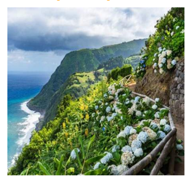
Ponta Delgada - São Miguel - Terceira - Faial

In Sao Miguel, a day after your arrival, you will visit a traditional pineapple plantation, where you can taste the pineapple's liquor. You will then continue on the west coast, on the narrowest part of the island where you can see both coasts from Pico de Carvão's viewpoint. You can also see Sete Cidades volcanic complex as well as the twin lakes (blue and green lakes). Next you will visit Terceira, Pico and Faial. Here you will visit a variety of museums, places to swim, and wine tastings. There a plenty of picturesque views including natural pools of black volcanic rock. On the final day, you will depart towards Espalamanca, following the mountain road with views to Vale Dos Flamengos, up to Caldeira, the highest point on the island. Then head towards Capelinhos to admire the remains of the last eruption in the Azores (1957).