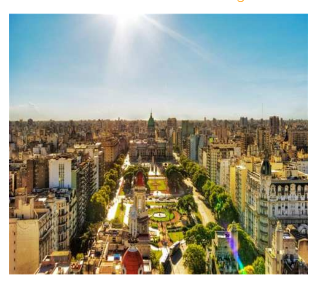
Buenos Aires - Iquazu Falls

Start your week with a half-day city tour of Buenos Aires. You will visit the National Congress, the ancient Council, the Metropolitan Cathedral, and the Colon Theatre, one of the 5 most important Opera theatres in the world. You will visit San Telmo area, one of the most antique districts of the city, as well as the Boca district, with its "caminito"- a picturesque pedestrian street. The following day, you will visit the northern area of Buenos Aires with a half day Tigre tour. On your way to Tigre area, you will pass by the Presidential residence in Olivos district and reach San Isidro district where you will visit the train station, commercial mall and craft market. Once in Tigre area, you will get on a catamaran to enjoy a relaxing trip with a wonderful view of the Parana Delta, an area of subtropical rainforest made of a thousand islands and islets. In the evening, you will enjoy a Dinner and Tango Show. Then you are off to Iguazu Falls! There are more than 270 waterfalls along the cliffs and islets. The paths can be covered on foot or by a little train. The National Park has 2 circuits to be covered: lower and upper. In the lower circuit, one can reach the base of the falls, where the magnificence of their beauty can be appreciated. In the upper circuit, the tour is a bit more sedentary, where unique landscapes can be viewed from footbridges and viewpoints - an unforgettable experience.