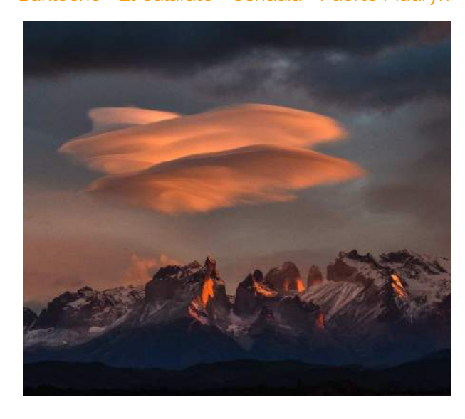
Bariloche - El Calafate - Ushuaia - Puerto Madryn

On this tour, you'll explore the beauty of Patagonia! Begin in Bariloche and head to Cerro Campanario, where you will see the Nahuel Huapi and Perito Moreno lakes, the El Trebol Lagoon, Victoria Island, and much more. In El Calafate, take an excursion to the Perito Moreno Glacier, and take an optional tour to Puerto Banderas for an Ice Rivers excursion. Then, fly to Ushuaia to enjoy the Tierra del Fuego National Park, where you'll find the lenga and sour cherry forests, and explore the Beagle Channel. Finally, in Puerto Madryn, journey towards the Peninsular Valdes Provincial Reserve, a protected natural area to observe a wide variety of wildlife, and an optional tour to Punta Tombo that holds the largest colony of megallanic penguins. Explore the "end of the world" for the adventure of a lifetime!