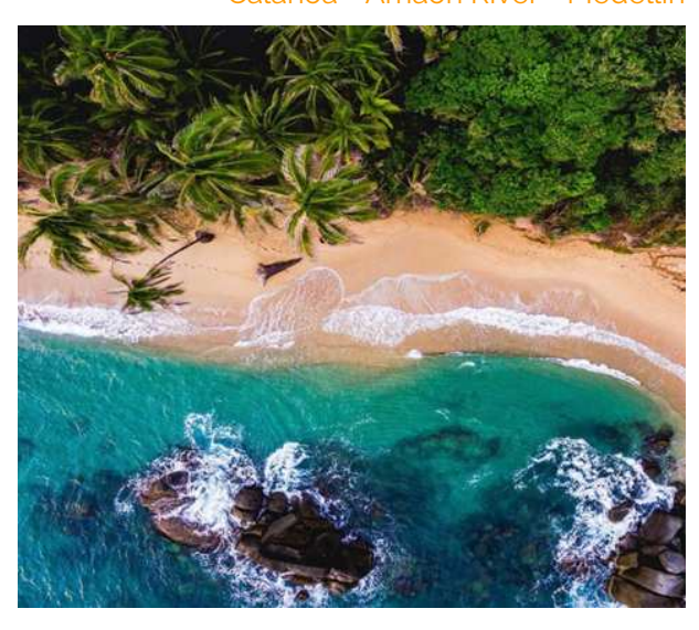
Bogotá - Paloquemao - Cocora Valley - Tayrona Park - Cartagena

On this tour, connect with nature and wildlife with an adventure through the Amazon and the Pacific. Begin on a boat journey from Leticia to the Calanoa nature reserve by sailing on the Amazon River. Discover the various indigenous communities of the Tikuna, El Vergel or Palmeras to learn of traditions and connections to the jungle. Hike the Calanoa, enjoying unique wildlife like monkeys, parrots, and armadillos. See the pink dolphins on the Amazon River, and enjoy a bird watching tour before flying to Medellin. On the sea, search for humpback whales in the Chocho region and hike to the village of Termales to bathe in the relaxing thermal waters. This is a nature-lovers dream!