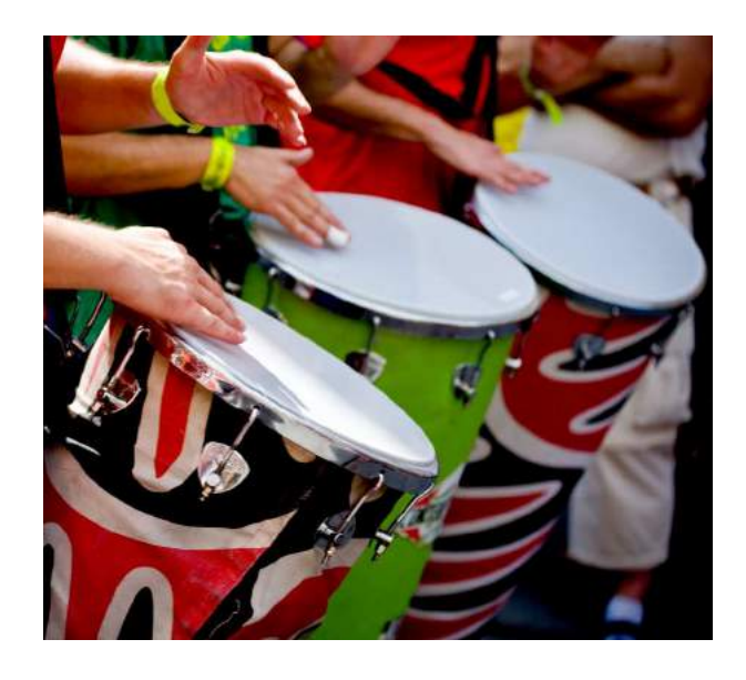
Rio de Janeiro - Sugar Loaf - Corcovado

The Carnival in Rio de Janeiro is a festival held every year before Lent and considered the biggest carnival in the world with two million people per day on the streets. The first festivals of Rio date back to 1723. One of the greatest elements of the Rio Carnival is that it not only provides entertainment for many people around the world but at the same time it gives also a chance to learn about the true culture of Brazil. It is a euphoric event where people dance, sing, party and have tons of fun. There are many parties that take place before, during and after Carnival all night and all day. It allows someone's true heart to come out and have as much fun as possible. Call us and let us plan your Carnival in Rio Adventure.