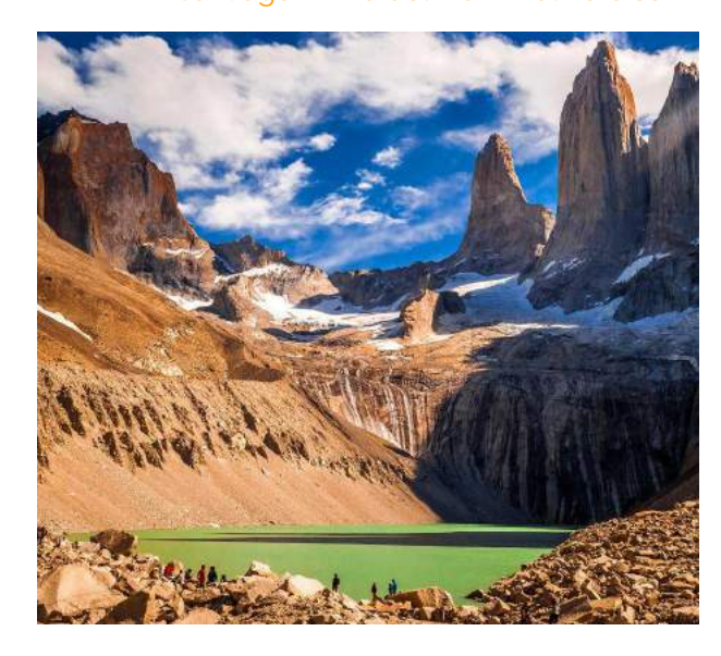
Santiago - Vina del Mar - Val Paraiso

Add this bucket list experience to your Chilean adventure for a total package of what Patagonia has to offer. You'll begin at the Balmaceda Mount, where the glaciers you are visiting will be located. The Bories Cold Warehouse awaits, a national historic monument founded in 1913 by the Tierra del Fuego Exploitation Society. You'll see the waterfall and condors cliff, landing then at Puerto Toro to start a walk to the shore of Tempanos lagoon and then visiting the Balmaceda Glacier. Next, you'll visit the impressive Torres del Paine National Park, spotting Sofia Lake, Prat Mountain Range, Porteno Lake, Mesa Hill, Toro Lake, Toro Hill and Ballena Hill on the way. You'll continue to the infamous Grey Lake to see the front part of the glacier, then heading to the Paine Waterfall, with a few other namely lookouts on the way. Finally, you'll embark on the most iconic trek in Torres del Paine National Park — the ascent to the Base of Las Torres. This is definitely a must-see experience!