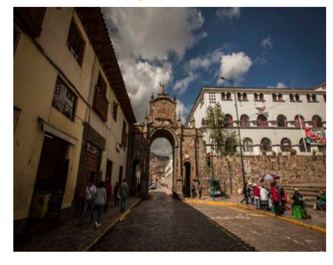
Lima - Cusco - Aguas Calientes - Machu Picchu

On this tour, you'll get a truly authentic look at Peru. You will visit Lima and Cusco, two of the most famous cities in Peru. See the panoramic view of "La Huaca Pucllana" and the district of Miraflroes. In Cusco, visit the temple of the sun and four ruins: the archeological complex of Sacsayhuaman, Quenqo, Puca-pucara and Tambomachay. After these few days, you'll travel to the Sacred Valley of the Incas, visiting the Archaeological Complex of Pisac Ruins and Market, and Ollantaybambo. A train will take you to Aguas Calientes, and from there, a bus to the famous Machu Picchu. This fabulous city contains houses, temples, warehouses, a large central square; all connected by narrow roads and steps that are surrounded by terraces cut into the mountain side. After a full day of exploring this historical Seven Wonder of the World, you'll have another chance to explore more of Cusco to end off your tour.