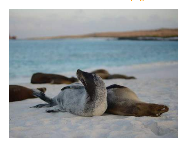
Cusco - Machu Picchu - Quito - Galapagos Islands

On this tour, you will have the opportunity to explore the incredible Galapagos Islands and visit the wonderous Machu Picchu – the Lost City of the Incas. After arriving in Lima, you will head to Cusco and the Sacred Valley, located in the middle of the Peruvian Andes. The city is famous for its spectacular main square and cobblestone street. You will then visit the wonderous Machu Picchu – the Lost City of the Incas. Designated a UNESCO World Heritage Site, this 15th-century Inca citadel is truly breathtaking. The following day, you will bid farewell to Peru and arrive in Quito, Ecuador to enjoy the capital city, the colonial architecture, and the "Mitad del Mundo" – the Middle of the World. You will then head on a Galapagos Cruise for 5 days, learning about the variety of diverse flora, fauna and wildlife in this amazing landscape.