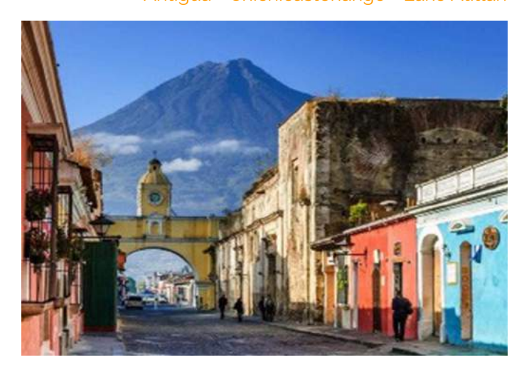
Antiqua - Chichicastenango - Lake Atitlan

Authentic Guatemala will take you to Antigua to visit its museums and various Indian Markets. Visit Chichicastenango and all its multicolored markets and traditions. Enjoy a scenic boat ride across Lake Atitlan to see the women's textile cooperative and village of Santiago. In Yaxha National Park, visit the archaeological site where you will walk the causeways under a tropical forest and visit temple 216, the highest structure in the area. Travel to Flores Island for a guided tour through Tikal – the most important city of the Mayan World. Witness the wildlife and the millennial temples. Head to Ixpanpajul Park for a Sky Walk, or the Canopy Tour for a day of nature adventure and much more.