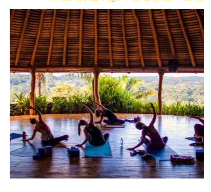
Rincon De La Vieja - Monteverde - Arenal

Start your journey from San Jose to Arenal, La Fortuna. Enjoy the trip as you watch your surroundings go from city to nature. Admire the greenery, the plantations, cattle farms and all that is around you as you head to the Arenal volcanic lands. A morning yoga class will start your next day before you adventure off into the area. There are plenty of options from kayaking to hiking to swimming to relax in hot springs. The next day, you'll begin with another morning yoga class before heading to Nicoya Peninsula where some of the top yogis in the world are. Two days of morning yoga classes will have you feeling refreshed before exploring the towns, relaxing on the beaches, or adventuring on catamarans and surfboards or paddleboards. On your final day, travel to San Jose where you can enjoy some nightlife and delicious food. After a week of meditation and yoga, you will leave Costa Rica relaxed and wanting more!