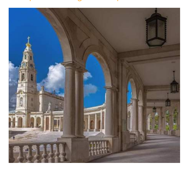
Fátima - Oporto - Santiago de Compostela - Lourdes

On day one explore Lisbon including the old Alfama district and its Praça do Comércio. Visit the historic district of Belem and its Belem Tower and the Monument of the Discoveries. Then, continue to Fatima with a stop in Santarem to visit the Church of the Holy Miracle. Continuing in Fatima, visit the Sanctuary and the Chapel of the Apparitions. You will have the opportunity to join in on activities held at the Sanctuary. Take part in a Mass or a candlelit procession during the night. The next day Visit Coimbra and the Convent of Santa Teresa – Sister Lucy lived here for more than five decades. Then travel to Oporto for a walk along Ribeira, the historic district site with the Church of St. Francis, the Cathedral and more. Cross the river to visit Vila Nova de Gaia for wine tasting. Then, travel to Spain to visit Santiago de Compostela – the third most important pilgrimage city. Explore the city of Santiago de Compostela for a full day. Visit the beautiful and picturesque Cathedral. The following day depart for Burgos, and visit the magnificent cathedral. You might have the opportunity to participate or watch a Mass. On your final day enjoy a full day in Lourdes. Visit the Grotto, the Basilica of the Immaculate Conception, the Basilica of the Rosary and Via Sacra. Today is Devotion to Our Lady of Lourdes. In the evening, you will have the opportunity to participate in the candlelit procession.