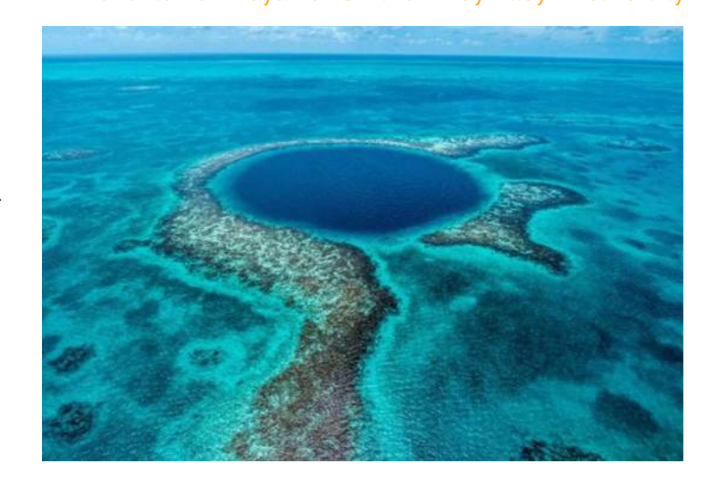
Xunantunich Maya Ruins - Shark Ray Alley - Belize City

Authentic Belize will take you on a tour to discover the jungle-shrouded temples of the Lamanai Mayan civilization — one of the largest Mayan ceremonial sites in Belize, encompassing over 700 structures. Visit the baboon sanctuary and learn of their natural habitats and the efforts being made to protect the species. Visit the Xunantunich Maya Ruins — home to El Castillo and over 25 temples and palaces. Go on an adventure and hike in a rainforest, then go to a cave called Xibalba, and swim into the underworld realm of the Mayans. Visit Shark Ray Alley and snorkel with the Nurse Sharks and sting rays and then relax and spend sun filled days in Ambergis caye. Finally, explore Belize City and all it has to offer.