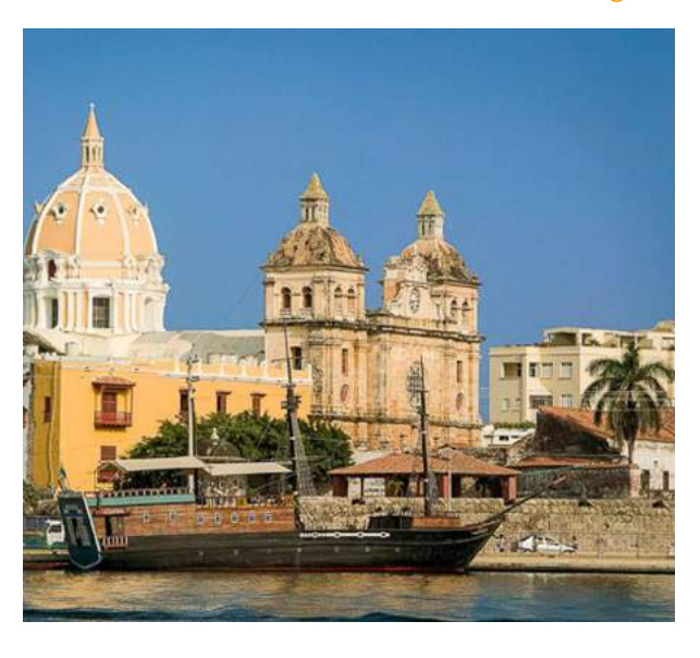
Bogotá - Villa de Leyva - Guane - Mompox - Cartagena

On this tour, experience the richness of Colombia with its bountiful history, culture, heritage and gastronomy. Begin in Bogota, the historical capital for a walking tour of the colonial district of La Candelaria. Visit Villa de Leyva, a typical Andean village with coffee and handicraft shops, a wool weaving workshop, and more. In the archaeological park of Monquira, El Infiernito, see the ancient astronomical center to understand the rituals of the Muisca civilization. In Barichara, enjoy the UNESCO World Heritage Site with a view of the Canyon de Suarez. Hike El Camino Real to Guane for beautiful views over the canyon. In Mompox, experience beautifully preserves Spanish colonial architecture, situated on the banks of the Magdalena River. Finally, enjoy the culturally rich Cartagena. This is a perfect trip for those who are looking to go back in time!