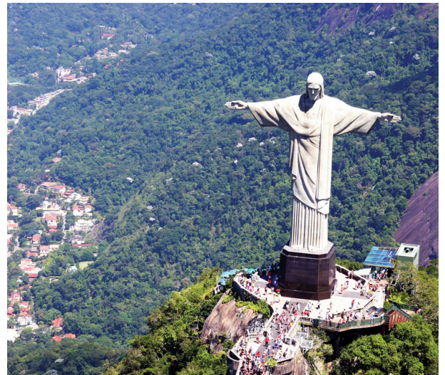
Rio de Janeiro - Sugar Loaf - Corcovado

After your first leisure day in Brazil, enjoy a half day city tour and Sugar Loaf. This tour begins with a panoramic view through downtown Rio, passing the Sambodrome and the metropolitan Cathedral Get to know the traditional Cinelândia Square with its historical buildings, the Municipal Theater, the National Library and the National Museum of Fine Arts. In the evening you will go for dinner at a local Churrascaria to enjoy a wonderful Barbecue and a Samba Show. Next, embark a full day cruise around Rio's Tropical Islands. White sandy beaches, gorgeous palms, and crystal clear waters are part of this paradise. Relax and enjoy yourselves on this cruise. Then you will take a train through a rain forest to the Christ Redeemer Statue. This half day tour will lead to a magnificent view from the top of the Corcovado Mountain with a panoramic view; you will witness spectacular sights of Rio and the surrounding countryside. The final days will be leisure days to do what you please in Rio. Perhaps visit the fabulous beaches of Copacabana or Ipanema.