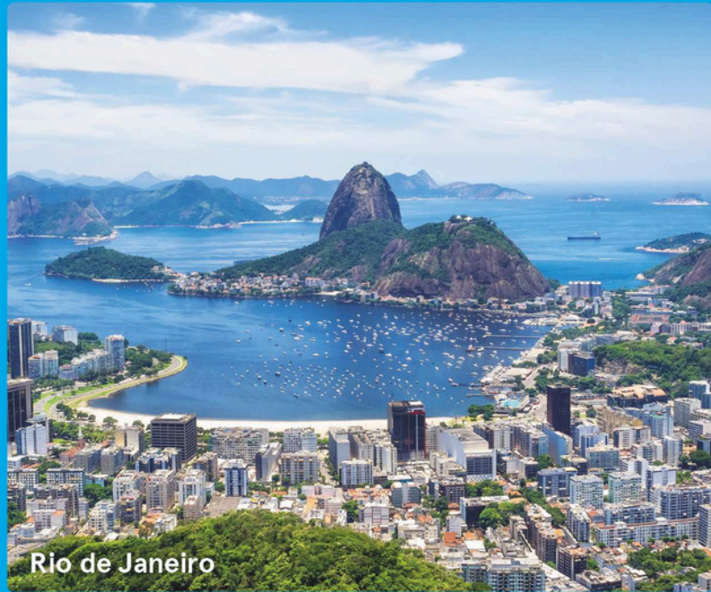
Rio de Janeiro